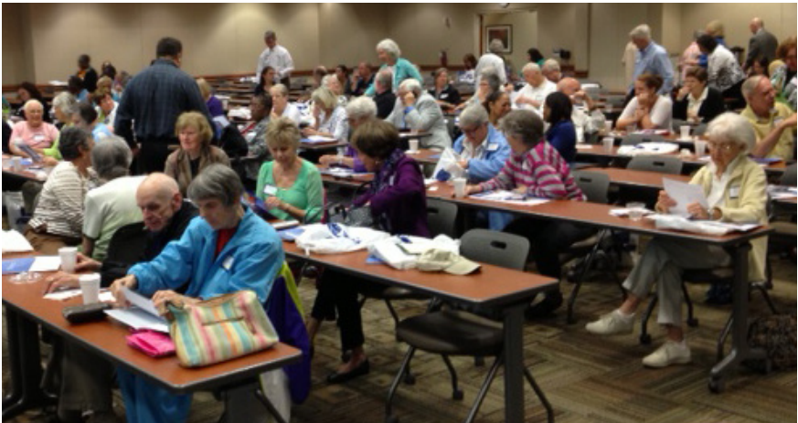
Participants at the recent forum - Conversations Today or Crisis Tomorrow – Planning Ahead for Life’s Final Journey

Visit our website to learn more about Conversations Today or Crisis Tomorrow—Planning Ahead for Life’s Final Journey . Look for our ongoing workshops, held on Tuesdays, called “ Choose-Days, ” to help people begin the conversation and document their wishes.