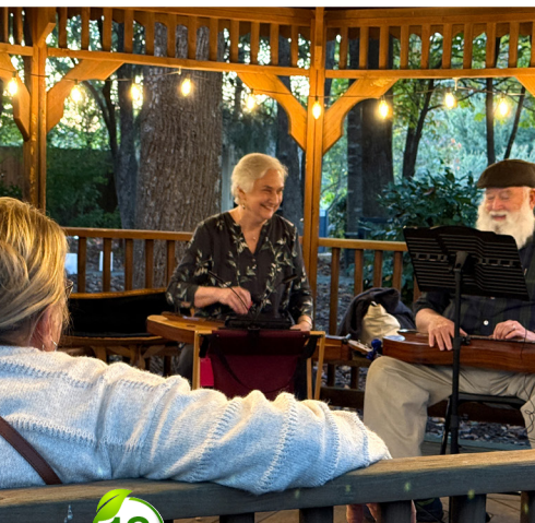
Annual Remembrance Service & Memorial Luminaire Walk

Veterans Memorial Services and Patient Pinnings – Proudly honoring the veterans we serve.