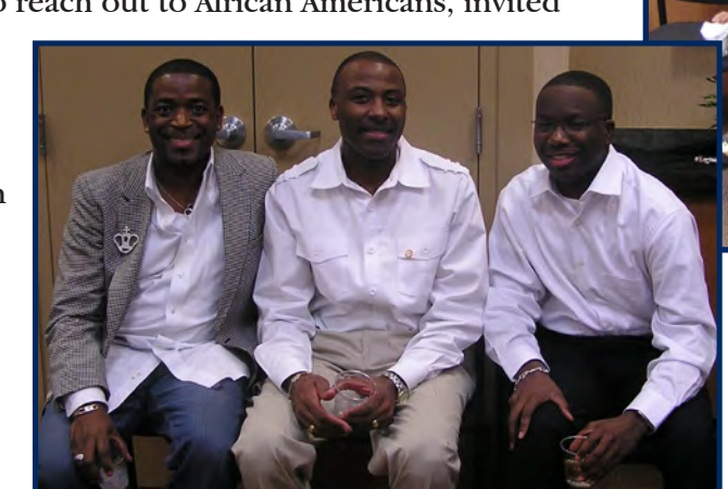
Attendees of the Winston Salem State University's National Alumni Association enjoying the event.

the association to have their annual reception on our campus. It was both a perfect setting for the reception as well as an opportunity to have thoughtful conversation and make a short presentation about Hospice services prior to the reception. Understandably, there continue to be myths and misconceptions about Hospice and Palliative care, and both the alumni and Hospice staff appreciated and enjoyed the opportunity to come together.